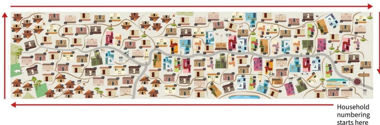
Fig. 2 The illustration of Surveyypura village. The direction of numbering of the households has also been indicated

Similar to the demographic cards, each of these cards corresponds to a particular household on the canvas. On one side, the card provides the data of that household for four questions related to the health of the members of the household (Questions 2a, 2b, 2c, and 2d—please see the questionnaire in Additional file 1 and the sample card in Fig. 4 to understand better).