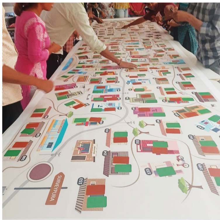
Fig. 5 Students completing an exercise in quantitative methods that employed Surveyypura

"Usually, slides or posters are on the wall - on the side... but this was in the centre, which also creates a lot of curiosity, excitement. Then students are not stressed out... If learning is intimidating, then learn-