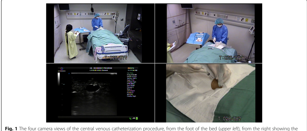
procedural tray (upper right), from the left showing the procedural site (lower right), and the ultrasound screen (lower left)

Participants were assigned to two groups in this study. Due to accidental violations in the randomization procedure, the majority of the participants (85%) were not randomized but assigned using unconcealed alternating group assignment. In the control group, participants were interrupted during a task that was felt to be low in complexity: skin cleaning for the insertion site. In the experimental group, participants were interrupted during a more complex task: establishing venous access under direct ultrasound guidance, where the interruption occurred as soon as the venous access needle entered the simulated skin.